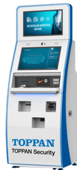
THERMAL PRINTING CAPABLE