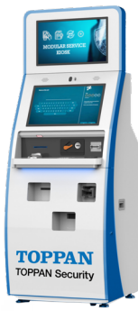
THERMAL PRINTING CAPABLE